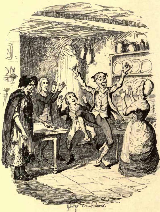
The Spac Wife in the Kitchen.